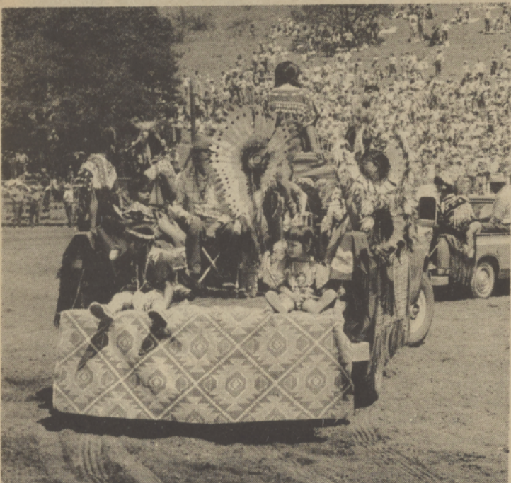
Dressed in colorful Indian Regalia, a group of local people from Warm Springs were part of the daily Grand Entry at the Tygh Valley All-Indian Rodeo.