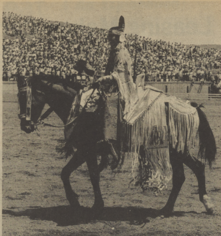
Queen Sally Rhoan of Warm Springs represented the Tygh Valley All-Indian Rodeo in the Grand Entry May 20 and 21 at Tygh Valley.

The events are: saddle bronc riding, bareback bronc riding, bull riding, barrel racing, team roping, calf roping, goat tying, pole bending, and cow cutting.