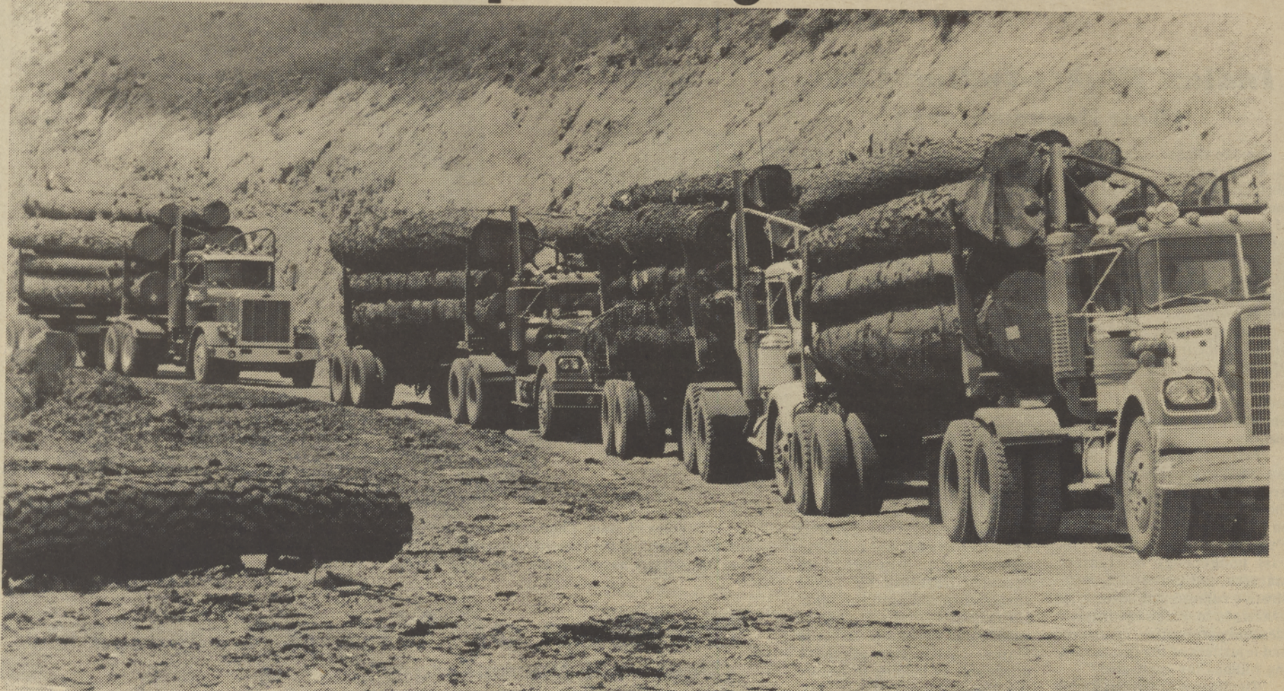
A caravan of log trucks wheeled into the Warm Springs Forest Products decking area May 15 to unload their first cargos of the 1978 logging season. Scalers said they

were coming in twice as fast as they could measure the logs, causing a back-up like the one above. Loggers were eager to get loads out of the woods since the accepting date had been moved back two weeks.