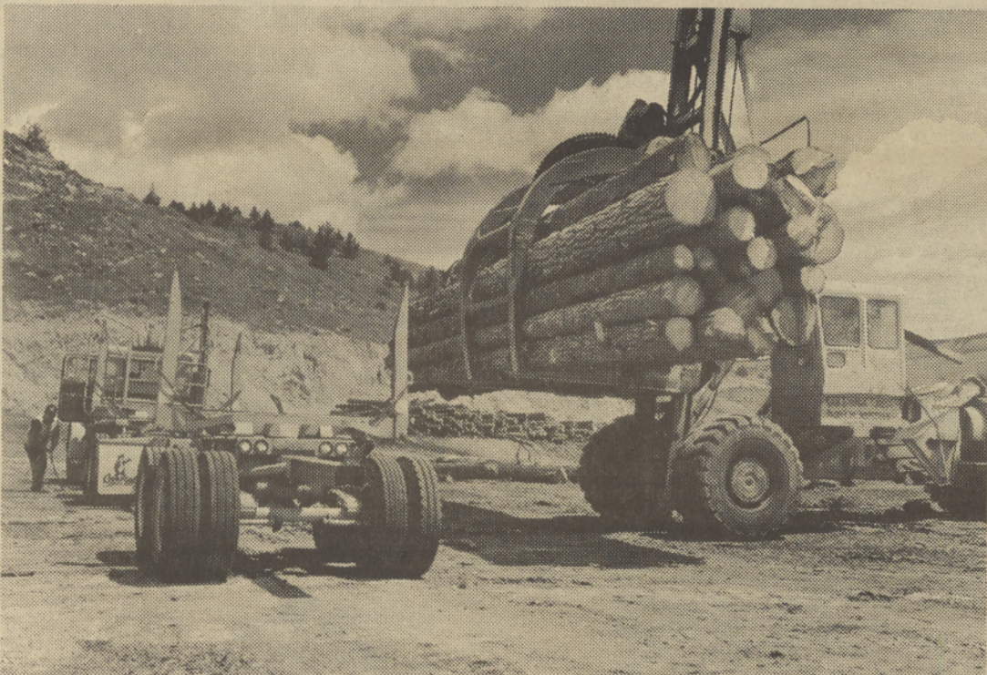
The whole load is removed from the trailers in one bite of a LeTourneau. Logs are scattered out for scaling purposes, then scooped up again to be decked.

were coming in twice as fast as they could measure the logs, causing a back-up like the one above. Loggers were eager to get loads out of the woods since the accepting date had been moved back two weeks.