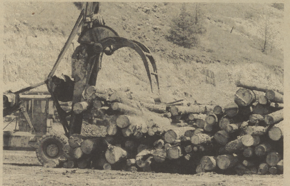
After the logs are scaled they are marked with a silver X and shuttled over to the growing log decks. LeTourneau operators raced against time on Monday, the first day for accepting logs into the mill, their hasty maneuvers raising dust and decibels.