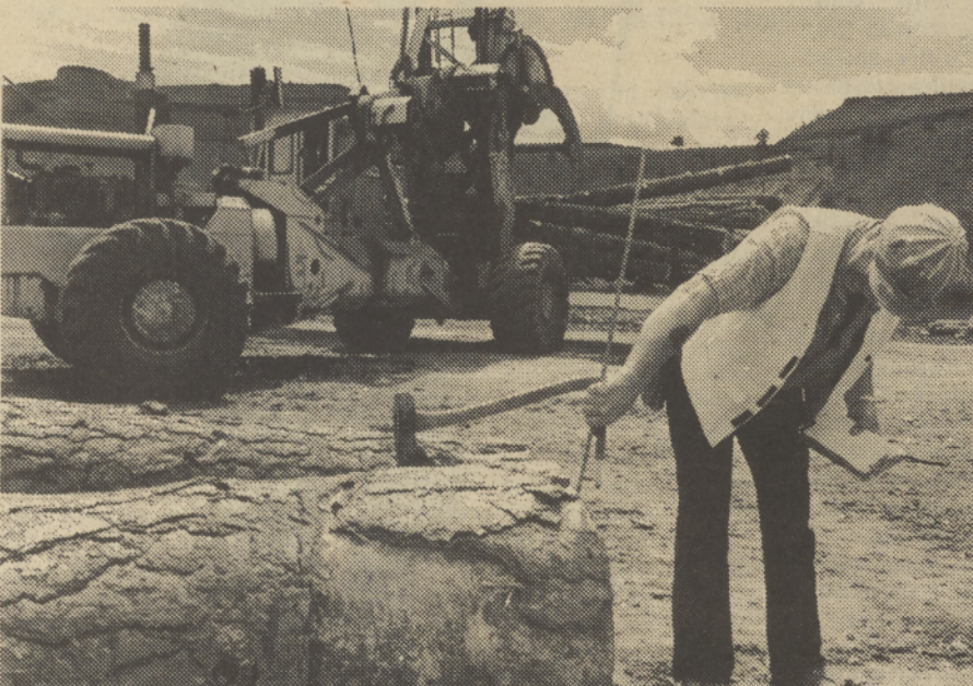
B.I.A. Scaler L.A. Stevens went about his business calmly amidst the dust and bustle of heavy equipment, but said it helps to have eyes in the back of the head. Scalers determine the net and gross volume of the wood by measuring the length and diameter of logs. Board feet are deducted for rot, the extent of which is estimated according to formulas.