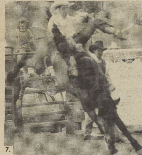
7. Root Feast Rodeo

8. Portland Trail Blazer Bill Walton was the center of attention July 29 and 30 when he came to Warm Springs to conduct a two-day basketball clinic in connection with Camp Ny-Mu-Mah. Walton's easy manner with kids has won him the admiration and respect of many.