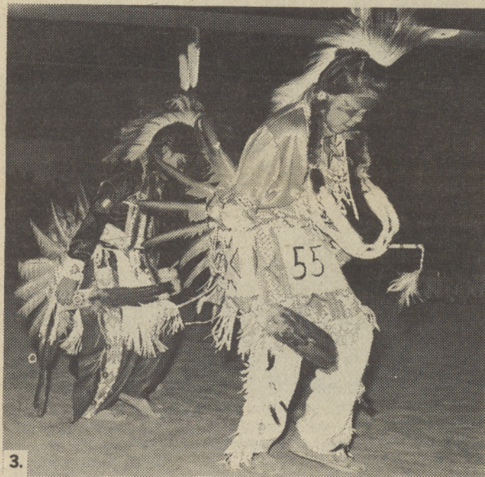
3. Dancing "Straight"