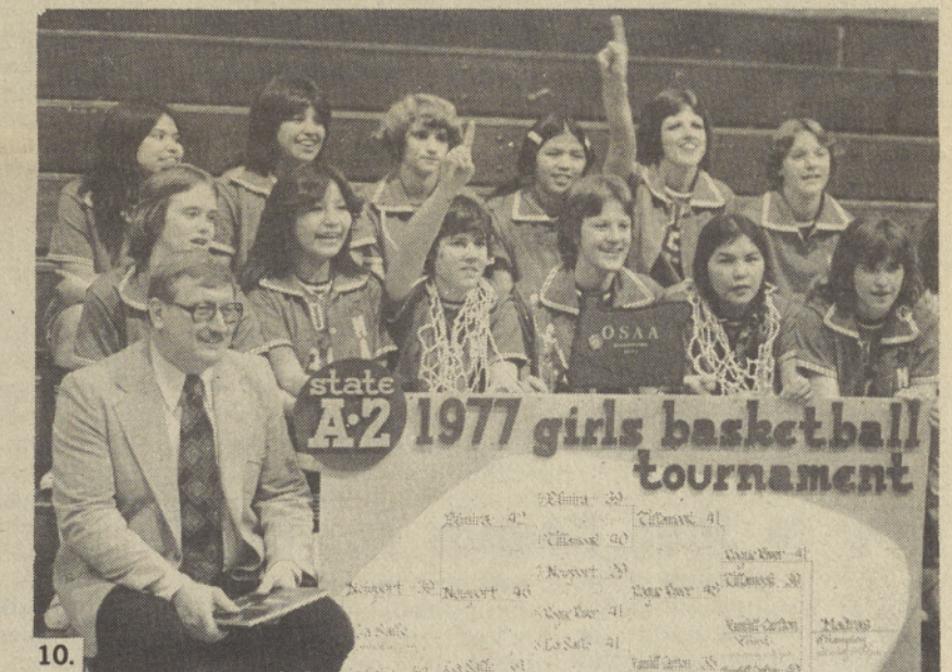
10. State AA Champs