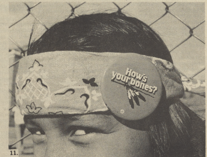
11. Three Warriors - mania