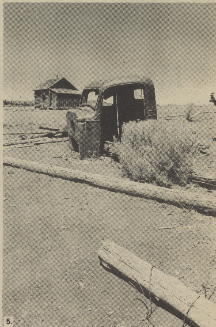
5. From Dustbowl...