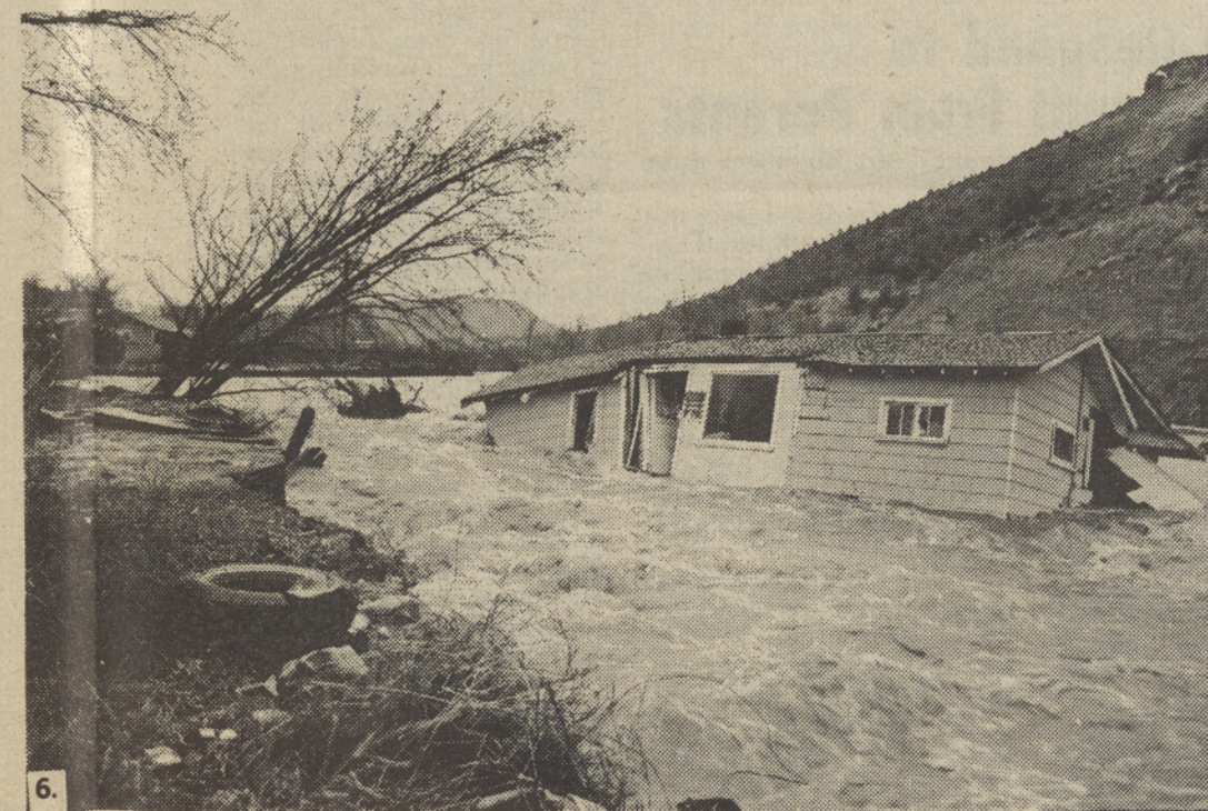
... To Deluge