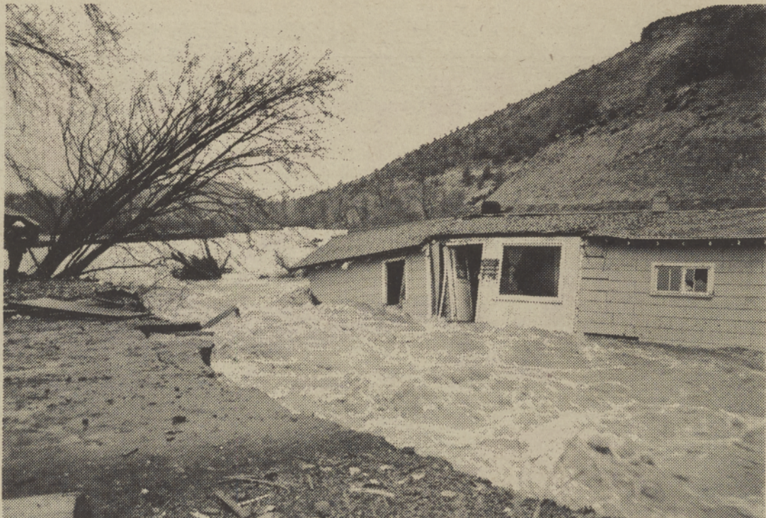
Flooding has caused one family to lose their home and another to be evacuated from their Greenville residence. Tribal management was worried that this house would break loose and damage the mill bridge just downstream. Here a member of the mill crew inspects a tree about to be claimed by the violent waters.