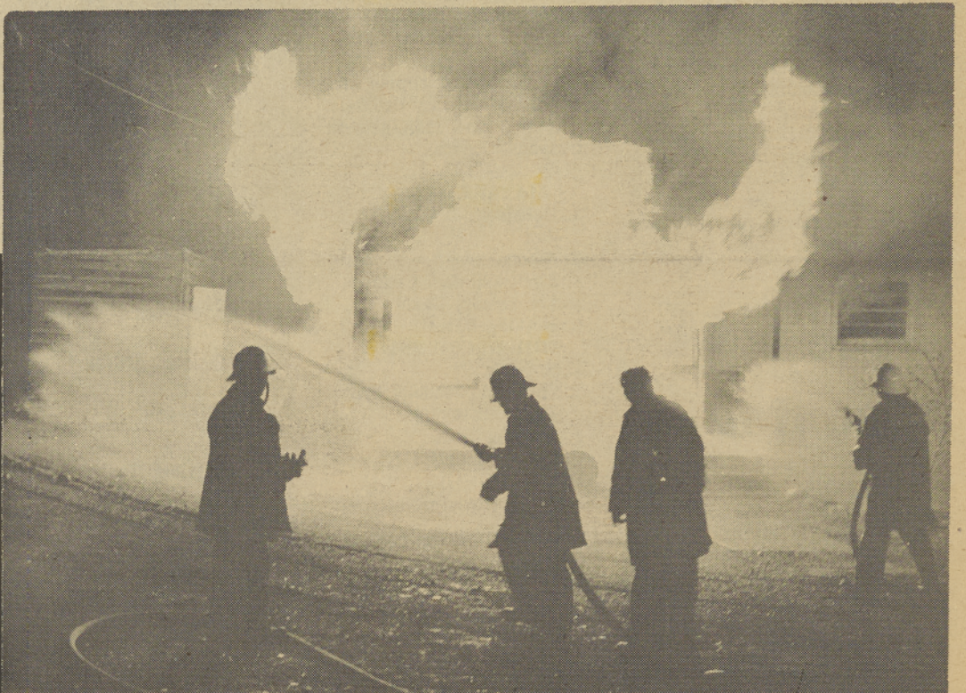
Firemen don't usually get to start fires as well as put them out, but the Warm Springs volunteer fire department is headed for a pyromania award. Wind and rain didn't discourage them from setting this house ablaze across from the community center March 7. It was one of many vacated houses that have been burned in the Park Area, Hollywood and Greenville clearance project, giving the fire department an opportunity to conduct drills.