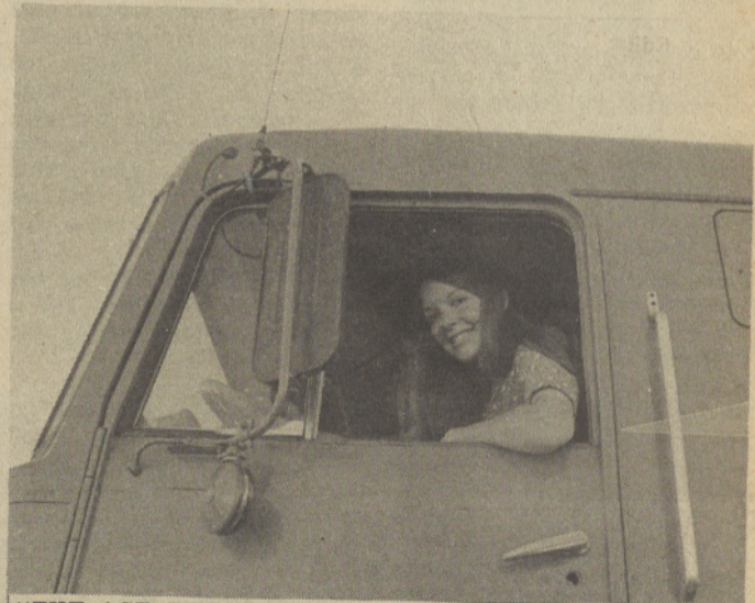
"THE ACE REPORTER" keeps on truckin' with the happy knowledge that her vacation is at hand. Now that she is back to work there will be no more horsing around.

Well, I must say that this "Ace Reporter" deserved a vacation as she has been putting in long hours for Spilyay Tymoo (Coyote News) without any complaints or gripes.