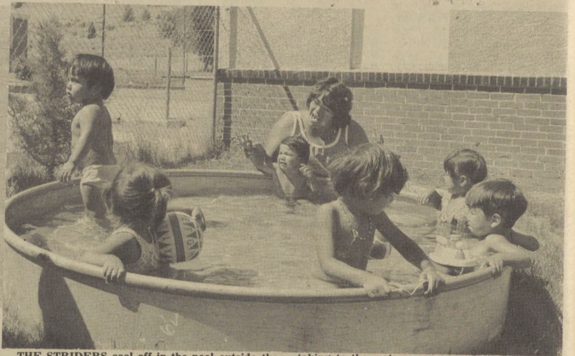
THE STRIDERS cool off in the pool outside the day care center. Not all of them seem to be taking to the water.