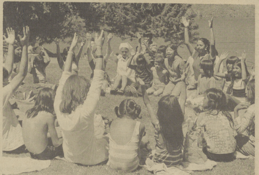
SUMMER RECREATION PROGRAM leaders sing along with the kids at the Cove before they return to the water after lunch.