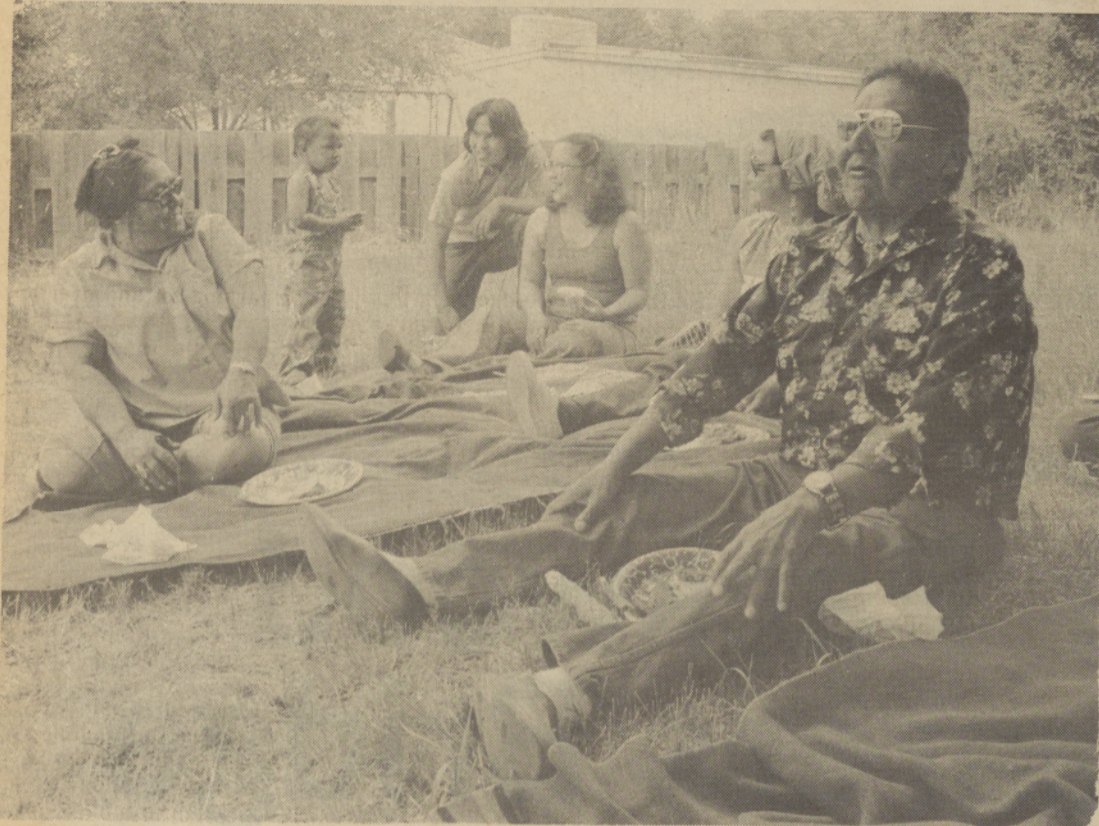
PICNICKING in the editor's backyard on the Fourth of July.