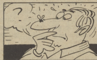
There are some people who say that if a fly lands on your nose, somebody has something to tell you!

Ultimately major planning and development decisions will be made through public hearings and general councils.