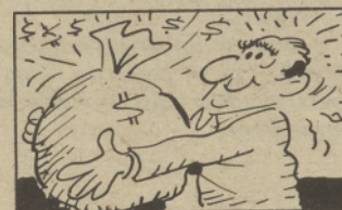
Some people believe that if your eyebrows grow together you will be very rich!