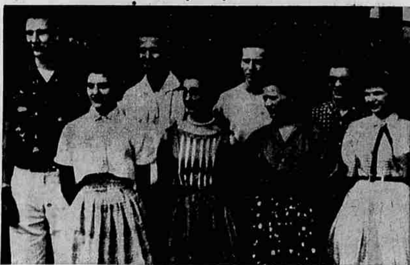
King and Queen of the May and their court, above, will have places of honor Wednesday night at Cascade Union High School. Their coronation will climax Achievement Night program for parents.