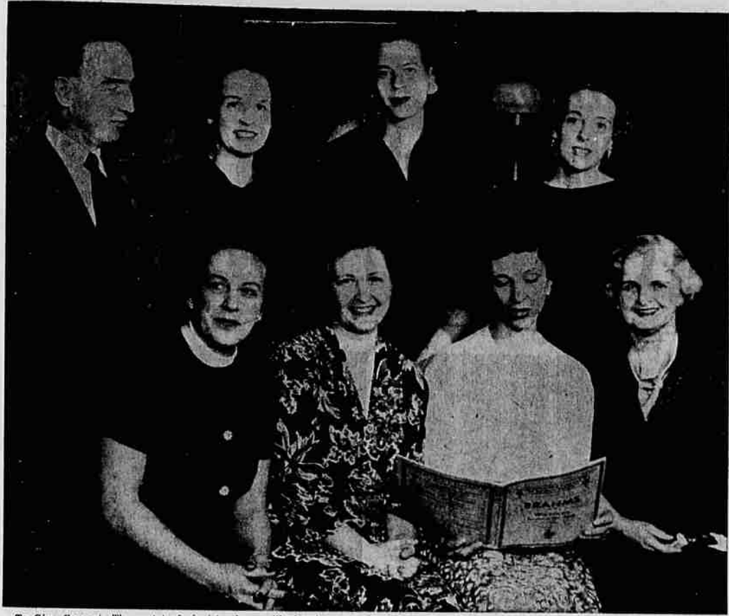
To Give Concert—The septet of pianists above will play in concert next Friday night at 8:15 o'clock in the Willamette University Fine Arts auditorium.