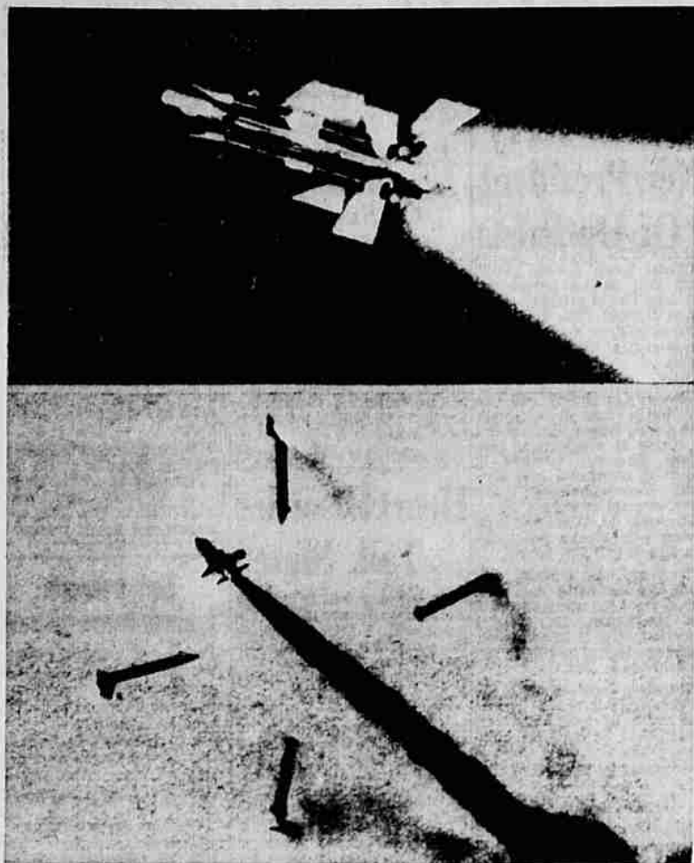
Four booster rockets provide the power for takeoff of this British test missile. After attaining high speed the boosters fall away and the motor of the craft takes over to drive it farther into the sky. The missile is used to test equipment in that type of flight, information obtained being radioed back to its base automatically from the missile.