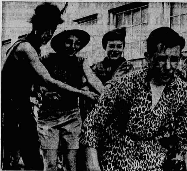
Wild costumes, extra privileges and a little horseplay were all present at Parrish Junior High Friday for the first annual Spring Fever Day.