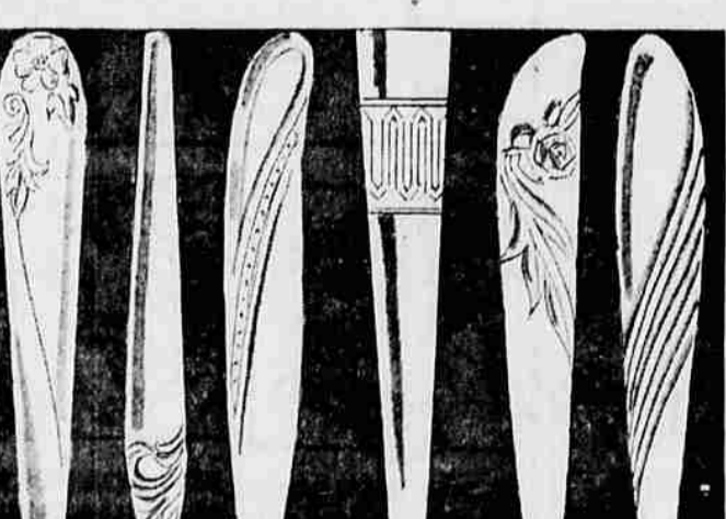
choose from six smart patterns: