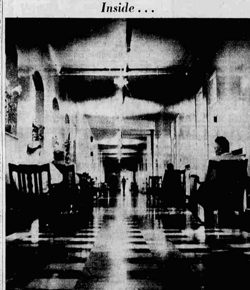
This long, drab hall, and others like it, is home to one of every 500 people in Oregon. The Oregon State Hospital, spread over 2,000 acres with a population of more than 3,500, is an important part of Oregon's institutional system. Open house will be held at the hospital Sunday. Story and more pictures on Section 4, Page 8.