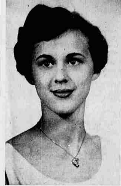
(Kennell-Ellis studio picture)