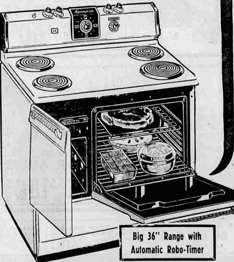
Big 36" Range with Automatic Robo-Timer