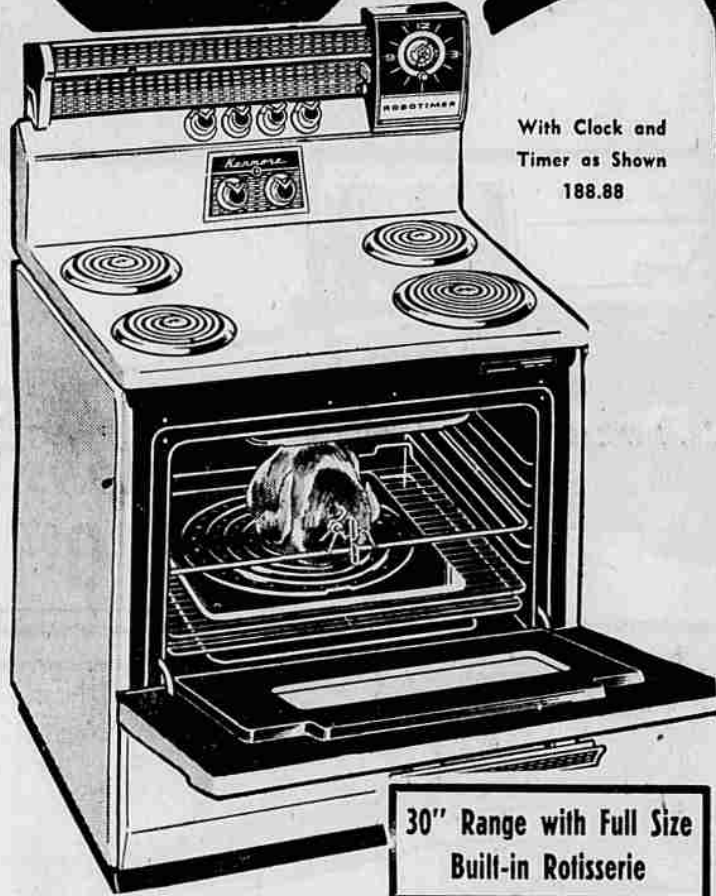
With Clock and Timer as Shown 188.88