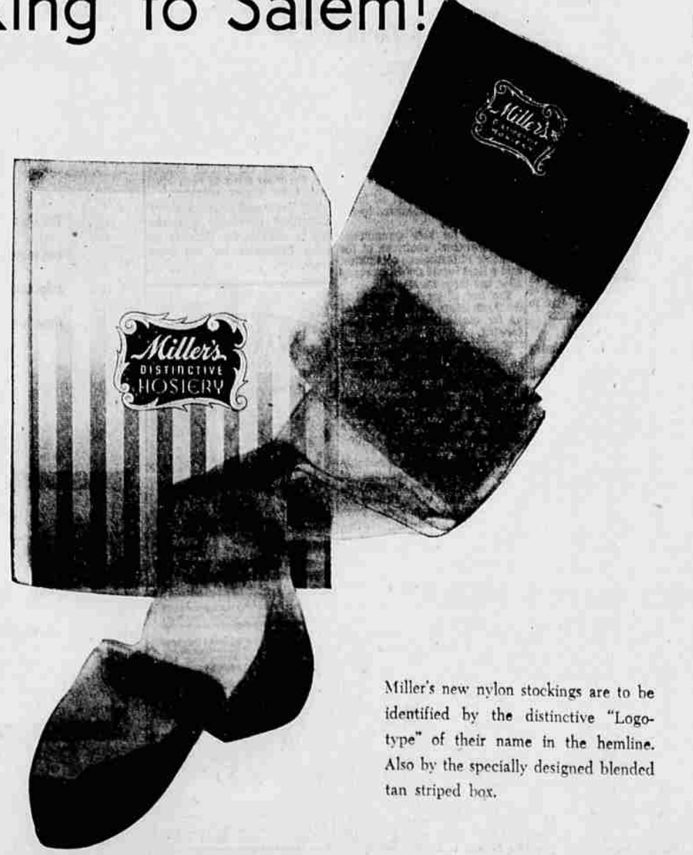
Miller's new nylon stockings are to be identified by the distinctive "Logo-type" of their name in the hemline. Also by the specially designed blended tan striped box.