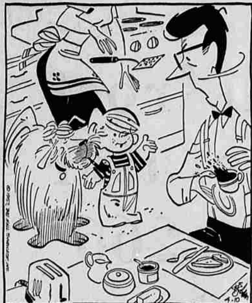
"LOOK, DAD! RUFF'LL HOLD YOUR PIPE IN HIS MOUTH IF I DIP THE STEM IN HAMBURGER!"