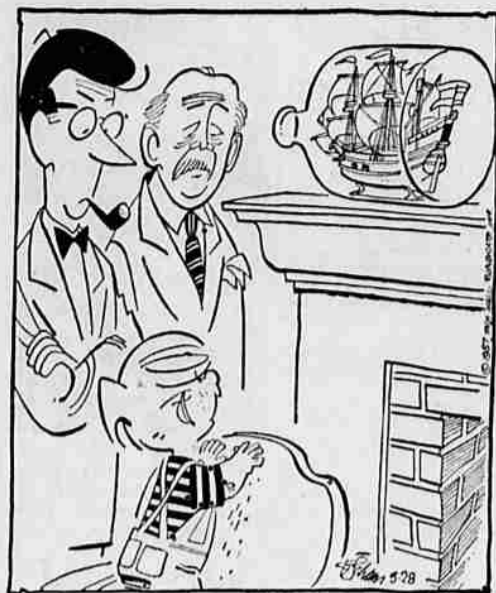
"I'LL BET I COULD GET IT OUT!"