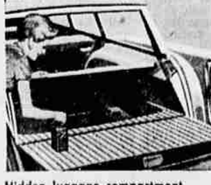
Hidden luggage compartment Locked space for safe, out-of-sight storage of luggage and valuables. On 6-passenger models.