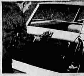
down into tailgate. Locks securely from inside. Electrically controlled on all 9-passenger models.