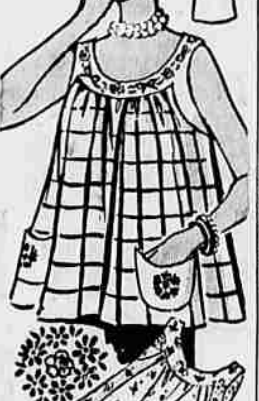
7284 by Alice Brooks

"A man should dominate the woman. Not push her around, but he should wear the pants. American women are too aggressive and that's not feminine."