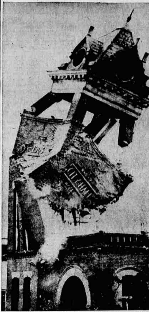
NAVASOTA, Texas—The 54-year-old Navasota City Hall came tumbling down to make room for a new one to be built on the same site, when demolition crews pulled out one corner of the tower which formerly housed the clock.