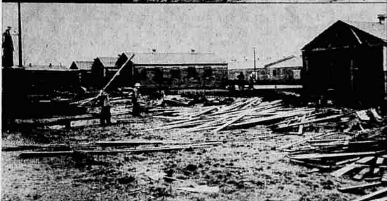
Piles of lumber, a brick vault and chimney shown in the upper picture are all that remain of the post headquarters, first building constructed at Camp Adair in