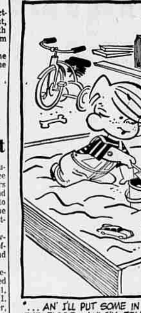
... AN' I'LL PUT SOME IN THE BED, AN' SOME ON THE FLOOR, AN' I'LL TELL HER THE SANDMAN DID IT!