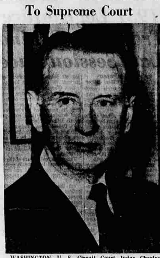
WASHINGTON—U. S. Circuit Court Judge Charles Evans Whittaker of Kansas City, Mo., poses at the White House today after his nomination by President Eisenhower to be an associate justice of the U.S. Supreme Court.

Students and Solons Trade Yells at OSC CORVALLIS (U)—Oregon State College students used the occasion of Friday night's Oregon State-Washington State basketball game to lobby for increased appropriations for higher education.