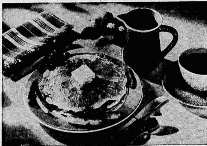
HIGH, WIDE and HANDSOME! That's chuck wagon style for serving hotcakes. High stack, big wide cakes, handsome to look at. Link sausages make it a he-man dish.

Make your family plumb breakfast-happy...with real chow and smart cooking. Come in today for these Western recipes. Big breakfast ideas; some traditional, some brand new. All of them hearty!