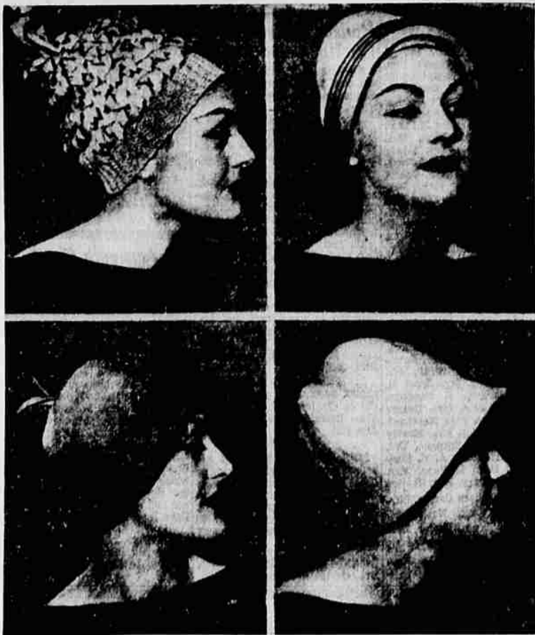
Fruit is the motif—Here are four spring hats—styled after fruit—by Parisian milliner, Svend. Left to right, top to bottom, are pineapple, pear, pink apple and melon.

Method: Drain liquid from beans into a measure; add enough milk to make 1½ cups. Melt butter in medium-sized saucepan over low heat; stir in flour, remove from heat. Gradually add milk mixture, whisking until smooth after each addition. Cook and stir constantly over moderately low heat until thickened and boiling. Whisk in salt and pepper. Remove from heat. Beat egg yolk with fork to mix well; vigorously but slowly whisk a little of the hot mixture into the egg yolk; beat back into hot sauce. Whisk in lemon juice. Add drained green beans. Reheat gently; do not allow to boil. Serves 4 to 6 servings. Now is the time for all good men