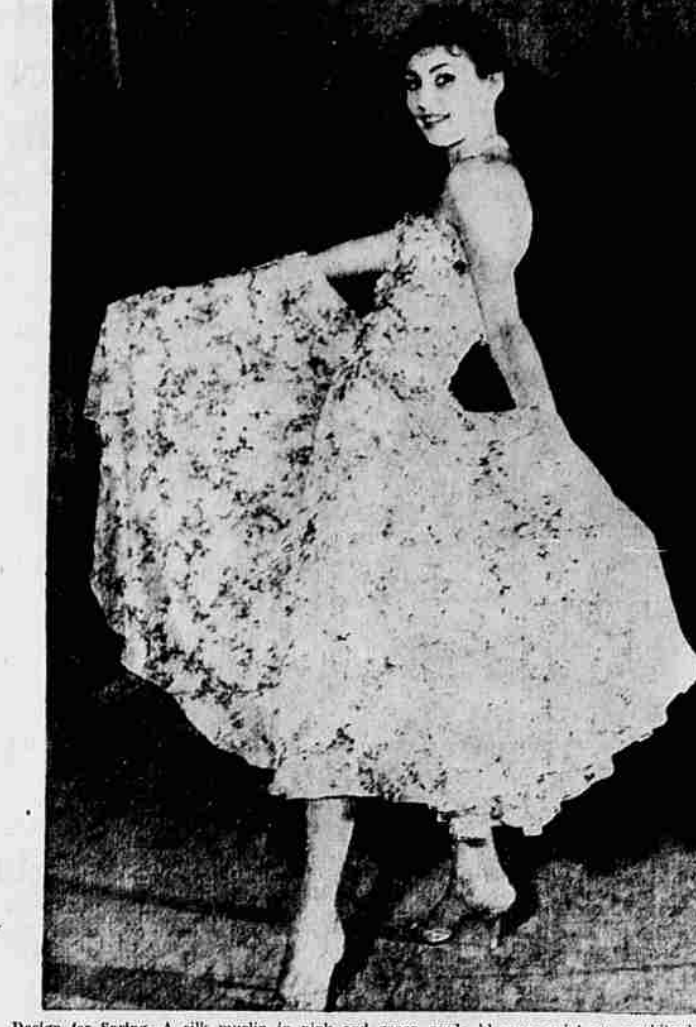
Design for Spring-A silk muslin in pink and green apple blossom print on a white background made its debut in Paris fashion show, presented by Chanel.