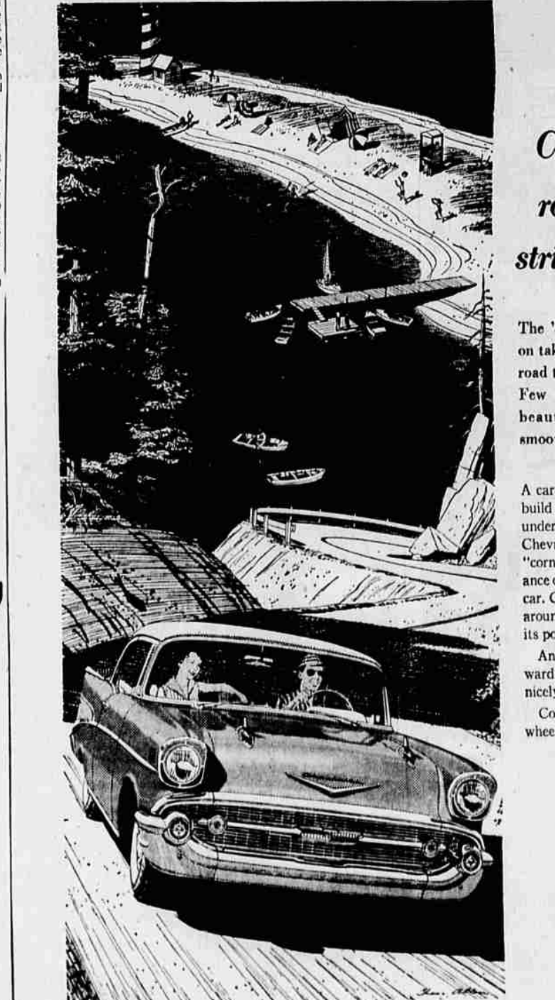
Sweet, smooth and sassy—that's Chevrolet all over. Above, you're looking at the Bel Air Sport Coupe.