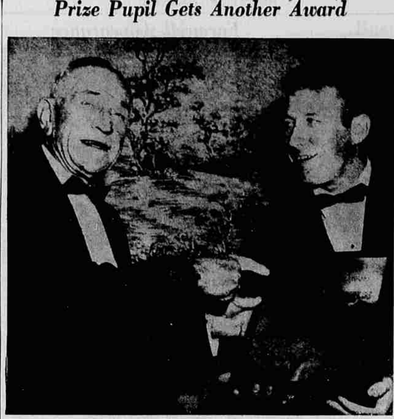
NEW YORK—The Old Professor, manager Casey Stengel of the New York Yankees, points with pride to a plaque held by his star center fielder, Mickey Mantle, after the latter was named player of the year Sunday night at an annual banquet of the Baseball Writers Association of America.