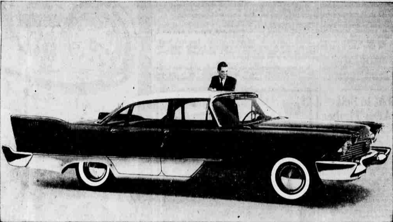
The Savoy 4-door sedan — one of three great Plymouth lines.