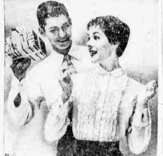
Valentine Shirts—Make his and her shirts in matching colored broadcloth to wear on Valentine's Day.