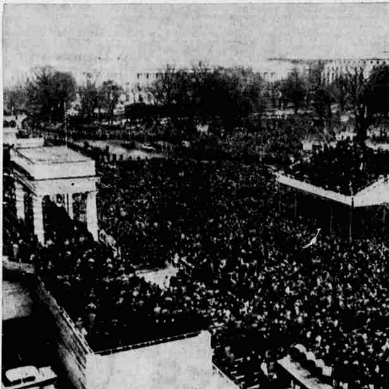
WASHINGTON—Here's a view from the House roof during public ceremonies at Capitol today as President Eisenhower and Vice President Nixon were sworn in for second terms. Camera-men fill stand above crowd at right center.