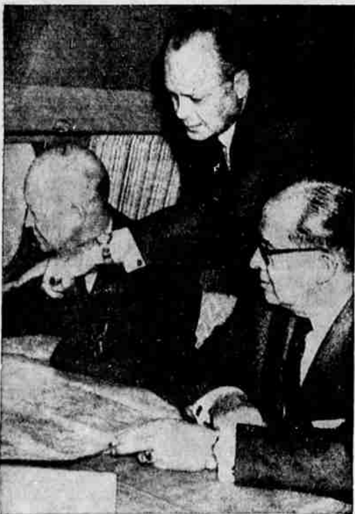
President Eisenhower looks out window of plane, the Columbine, as he gets a first hand look at the drought area in the southwest. Posing in Sec. of Interior Fred Seaton and seated, right, is Sec. of Agriculture Ezra Taft Benson. The President took off from San Angelo, Texas, and flew to West Woodward, Oklahoma.