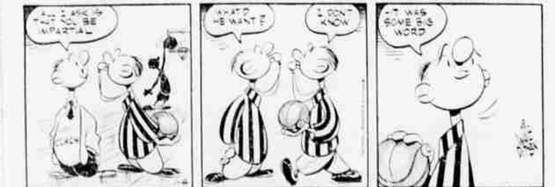
—By Ham Fisher