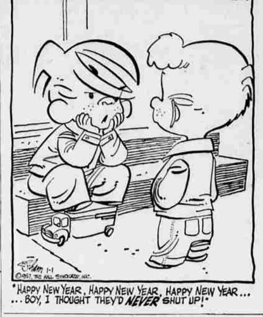
"Happy New Year, Happy New Year, Happy New Year... BOY, I THOUGHT THEY'D NEVER SHUT UP!"

On Television UHF—KPTV (27) VHF—KOIN-TV (6) KFOR (12), KGW-TV (8), KVAL (13) TUESDAY 5:00 p.m. KOIN—Red Dunning KFOR—Capt. Joe KVAL—Roundup KGW—Mickey Mouse 5:15 p.m. KPTV—Movie KOIN—Armchair KFOR—Gene Autry 5:45 p.m. KVAL—News, Wea. Spts. KOIN—Superman KOIN—Wea. Spts., News 6:00 p.m. KPTV—McGill News KOIN—Ewings News KFOR—Circus Kid KOIN—Sgt. Preston KFOR—Flashing-Hunting KVAL—Robin Hood KGW—Boss News 7:00 p.m. KPTV—Break the Bank KFOR—Big Surprise KVAL—Jungle Bean KGW—Polka Time 7:30 p.m. KPTV—Jonathan Winters KOIN—Trust Your Wife! KVAL—Secret Journal KFOR—Code 3 KGW—Cheyenne KPTV—National News KFOR—Big Surprise KOIN—Phil Silvers KFOR—Presentia KVAL—Big Surprise KPTV—Noah's Ark KFOR—The Brothers KFOR—Movie KVAL—Celebrity Playhouse KFOR—Wyatt Earp KOIN—Jane Wyman KGW—Broken Arrow KPTV—Aluminum Hr. KOIN—Red Skelton KVAL—Aluminum Hr. KGW—Theater KOIN—Code Three KGW—China Smith 10:00 p.m. KFOR—News KPTV—Badge 714 KOIN—3 Lives KFOR—Movie KVAL—Famous Play KGW—Movie 11:00 p.m. KPTV—Scarlet Pimpernel KOIN—Movie 11:30 p.m. KPTV—Tonight