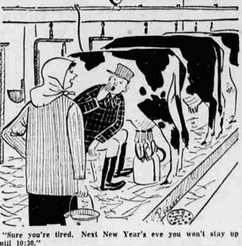
"Sure you're tired. Next New Year's eve you won't stay up until 10:30."