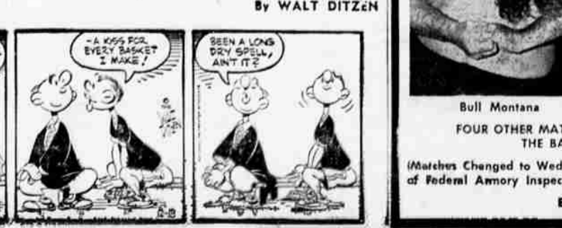
By WALT DITZEL