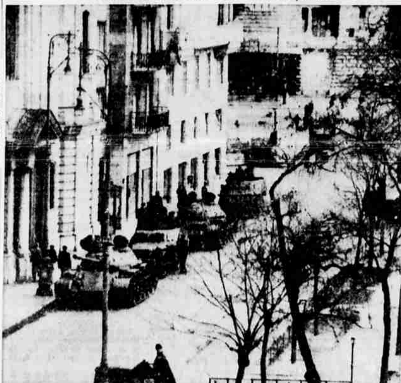
Russian tanks and armored cars line street near the Petefi statue in Budapest as Soviet armor opposed Hungarian women who staged demonstrations against the Russians and puppet government set up by them. The women were attempting to honor their dead—those killed in the October uprising.