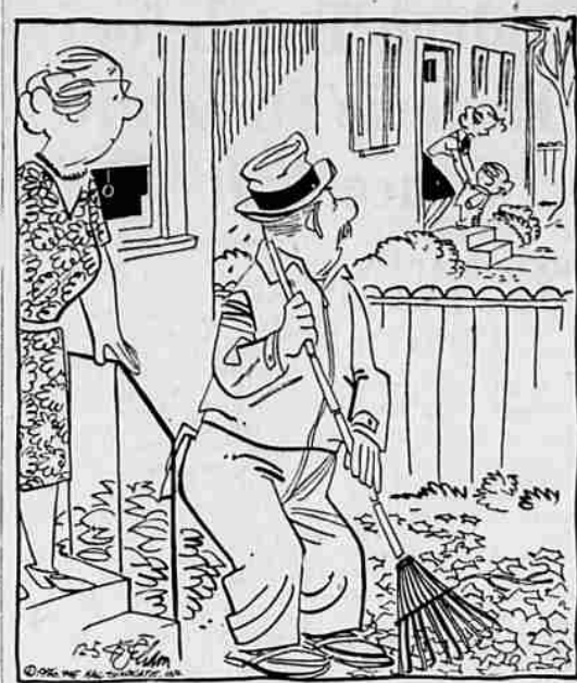
"OH-OH! SHE'S LETTING HIM LOOSE AGAIN!"