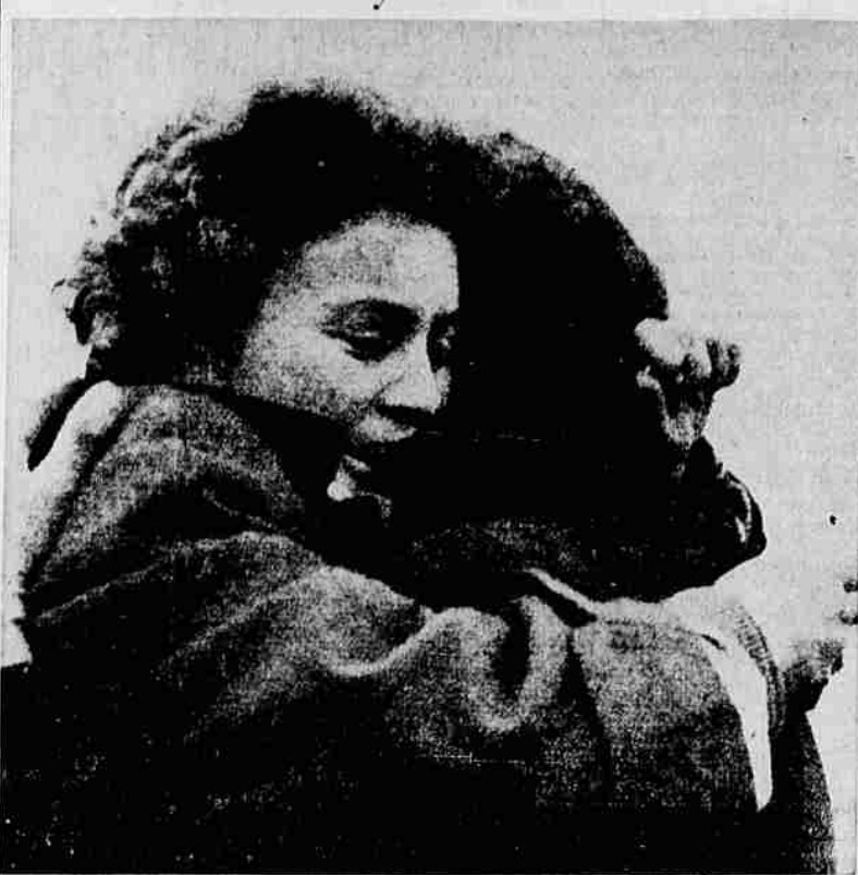
This woman had just crossed canal boundary between Hungary and Austria and fell into arms of friend with expression that told her story of relief on escaping Communist domination to reach freedom in Austria.