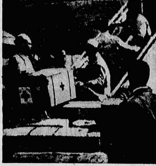
Egyptian workers unload Red Cross supplies at airport near Cairo, Egypt, today. The supplies are enroute to Port Said for victims of war following British-French invasion of the city on Suez Canal.