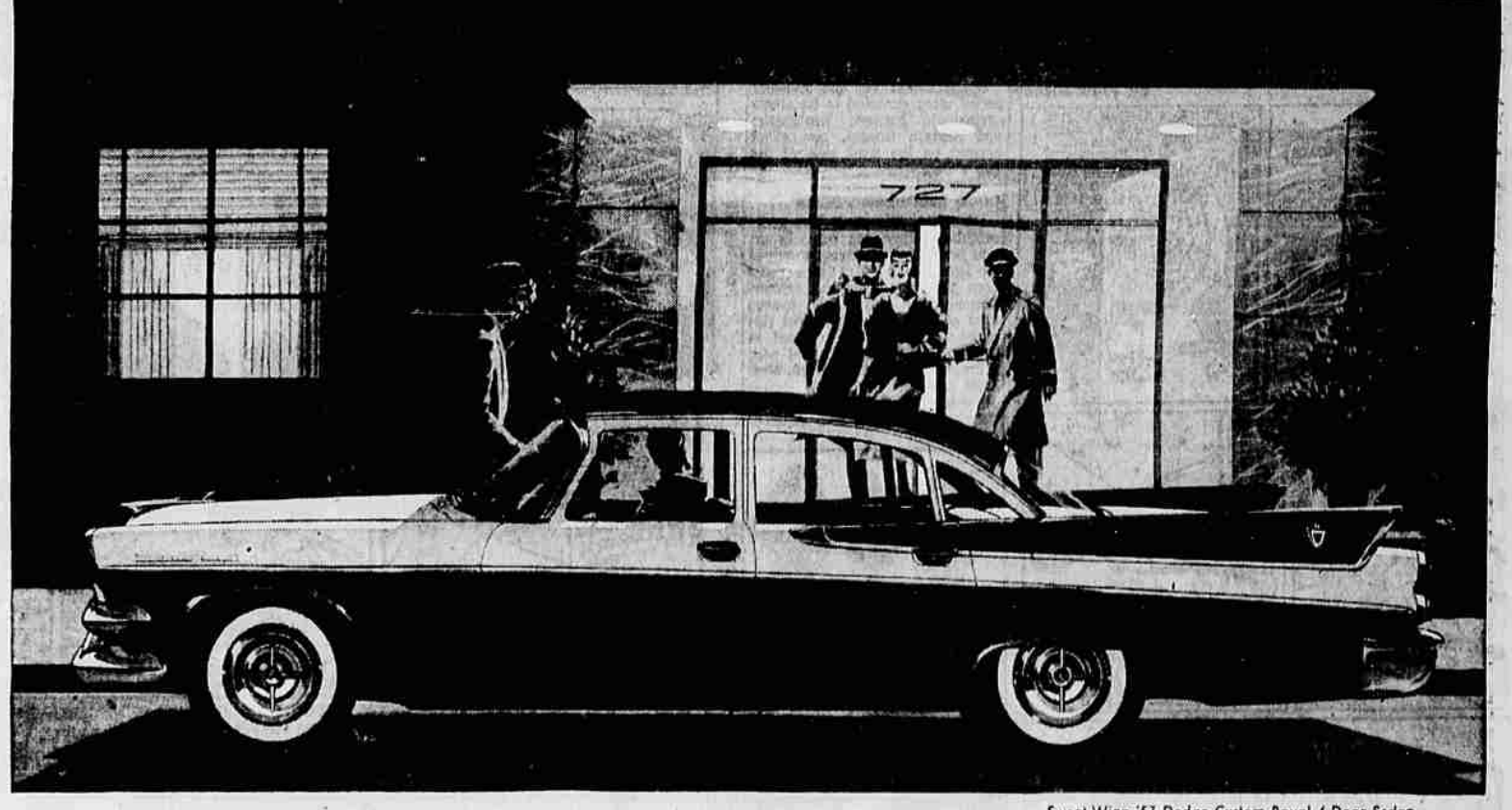
Swept-Wing '57 Dodge Custom Royal 4-Door Sedan

Step into the wonderful world of AUTODYNAMICS SWEPT-WING '57 Dodge