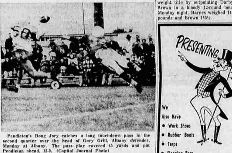
Pendleton's Dong Jory catches a long touchdown pass in the second quarter over the head of Gary Grill, Albany defender Monday at Albany. The pass play covered 45 yards and put Pendleton ahead, 13-0.