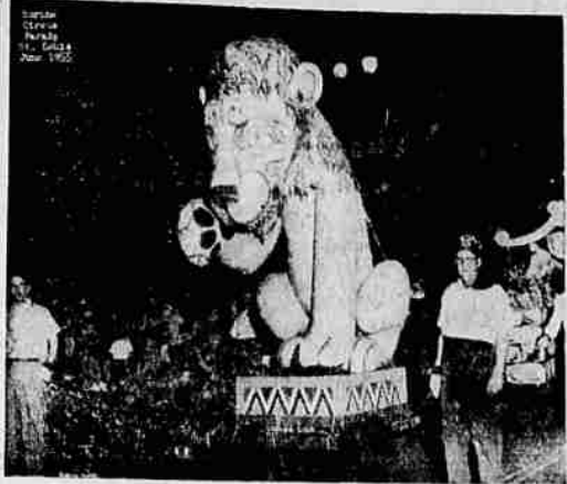
A giant lion and its tamer are one of the many circus-type giant balloons that will appear here next Saturday for the giant balloon parade sponsored by Salem merchants. The parade starts at 10 a.m. at the capital Mall.