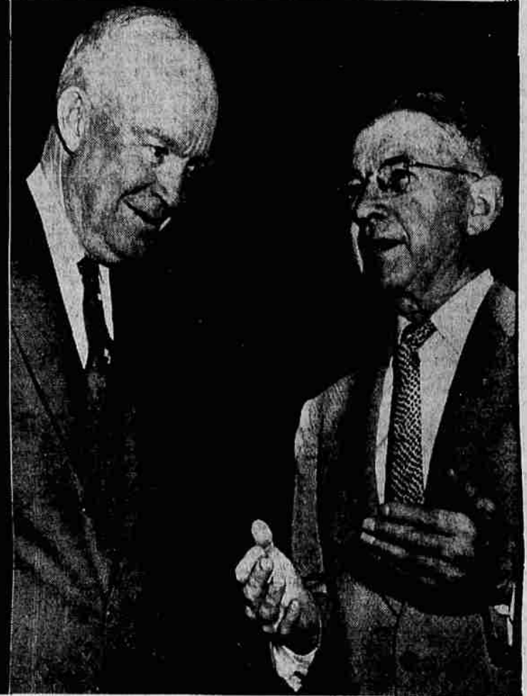
EISENHOWER AND MCKAY — PARTNERS FOR PEACE

Eisenhower asks you to support DOUG MCKAY