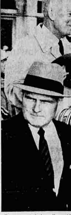
Ever-present during all presidential appearances along the Portland streets to see President Eisenhower in his first visit to Portland since being elected president in 1952. He rode in his famed bubble-domed car.