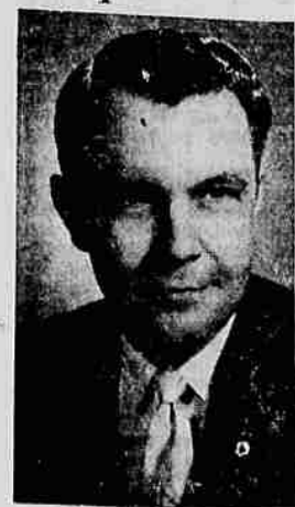
Wendell Ford, national Jaycee president will be guest speaker Monday noon at a joint meeting of the Salem Jaycees and the Chamber of Commerce.