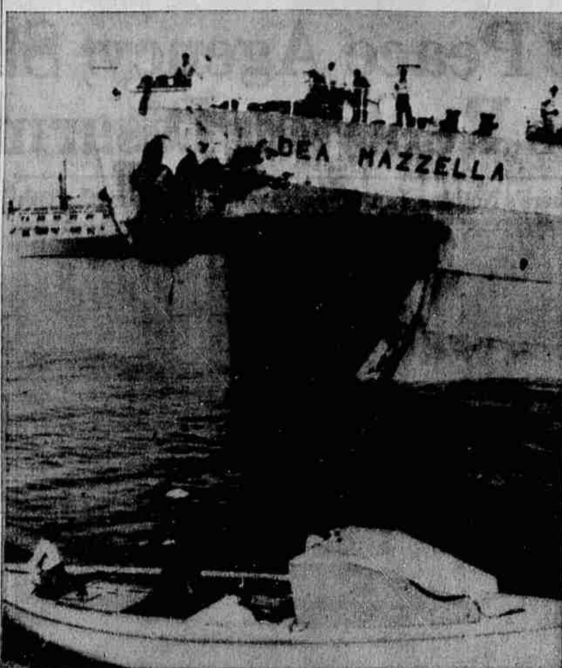
HALIFAX, N.S.—Small pilot boat passes gaping "mouth" smashed into bow of Italian freighter Des Mazzezza as ship arrives here yesterday following collision with Panamanian cargo ship Estoril 450 miles off Boston. Des Mazzezza picked up Estoril's entire crew of 33 safely as Panamanian vessel, loaded with iron ore, sank after collision in dense fog.