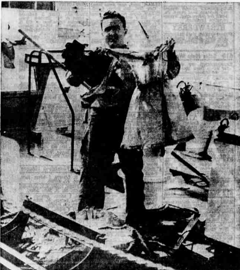
Coast Guardsmen aboard search craft standing on the flaming crash of Venezuelan airliner off New Jersey coast hold up dress of a young girl who will never wear it again. She was one of 74 persons—24 of them children—killed yesterday in the flaming crash of Venezuelan airliner off New Jersey coast. On deck lie other pieces of clothing and debris found floating at the crash scene.