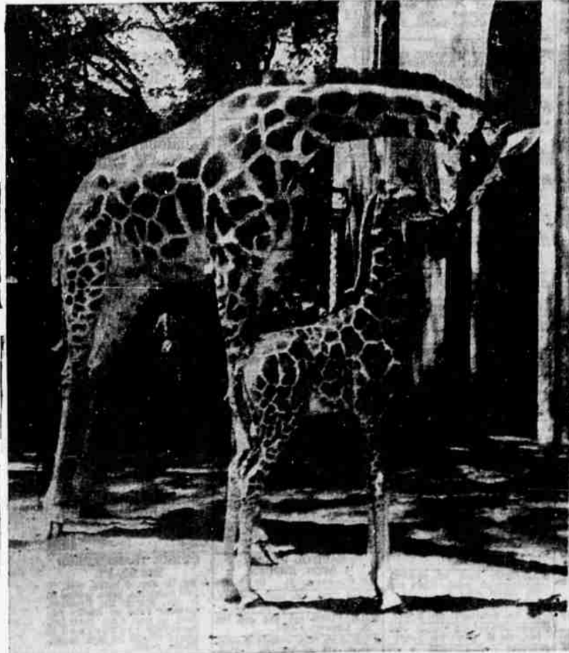
Astra, giraffe in the Rome Zoo, stoops her long neck to nuzzle Maja a few days following the birth of her long-legged daughter. Giraffes rarely breed in captivity and when they do, offspring are often sickly. But Maja has begun life fit and well.