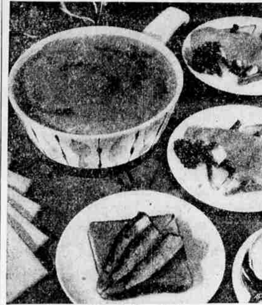
Rangtop Dish — Sardines with cheese sauce.