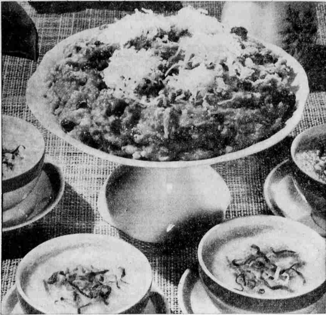
Custard type desserts with coconut are always favorites.

Coconut and custard type of desserts are always favorite standbys. Here are two especially tasty ones: