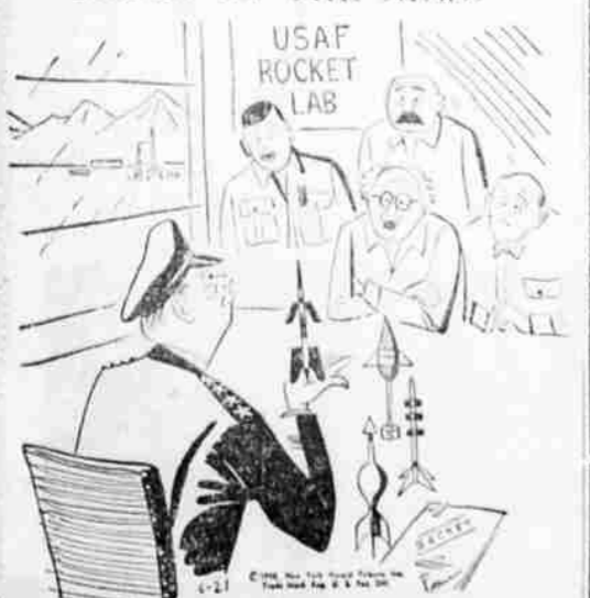
"We didn't invent that one, sir. We got it for a box top and ten cents."