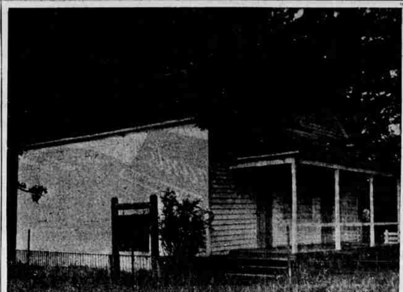
Pleasant Grove Presbyterian church on the road between West Stayton and Aumsville was organized January 1, 1855. The edifice is now the oldest and the second built by Presbyterians in Oregon. Completion date was 1858.