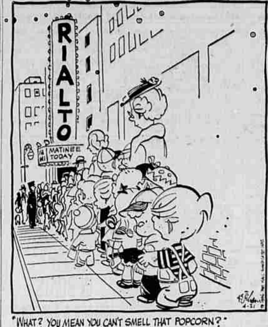
"WHAT? YOU MEAN YOU CAN'T SMELL THAT POPCORN?"

10:00 p.m.—Loretta Young Show stars Ricardo Montalban as priest who uses imagination to save church.